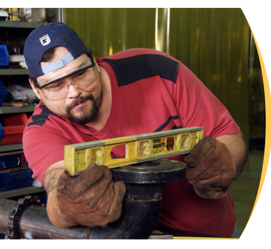
The council accelerated its trades agenda in 2006/07

"The cultural learning's I've already experienced by being involved in the development of the Mastering Aboriginal Inclusion program series modules has been invaluable. Effective use of these resource tools by employers will advance the employment and inclusion of Aboriginal job-seekers across Canada. It's a very positive step forward."